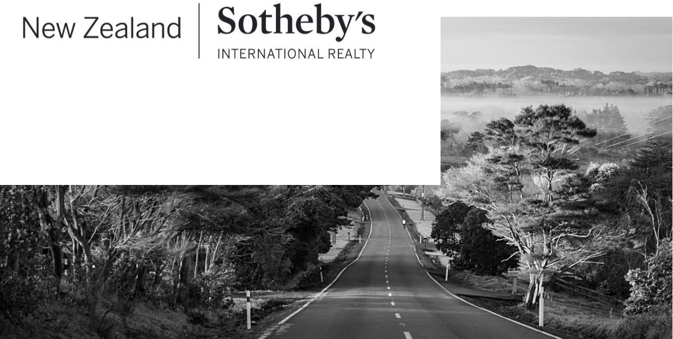
Each Office Is Independently Owned and Operated. NZSIR North Limited (licensed under the REAA 2008) MREINZ.