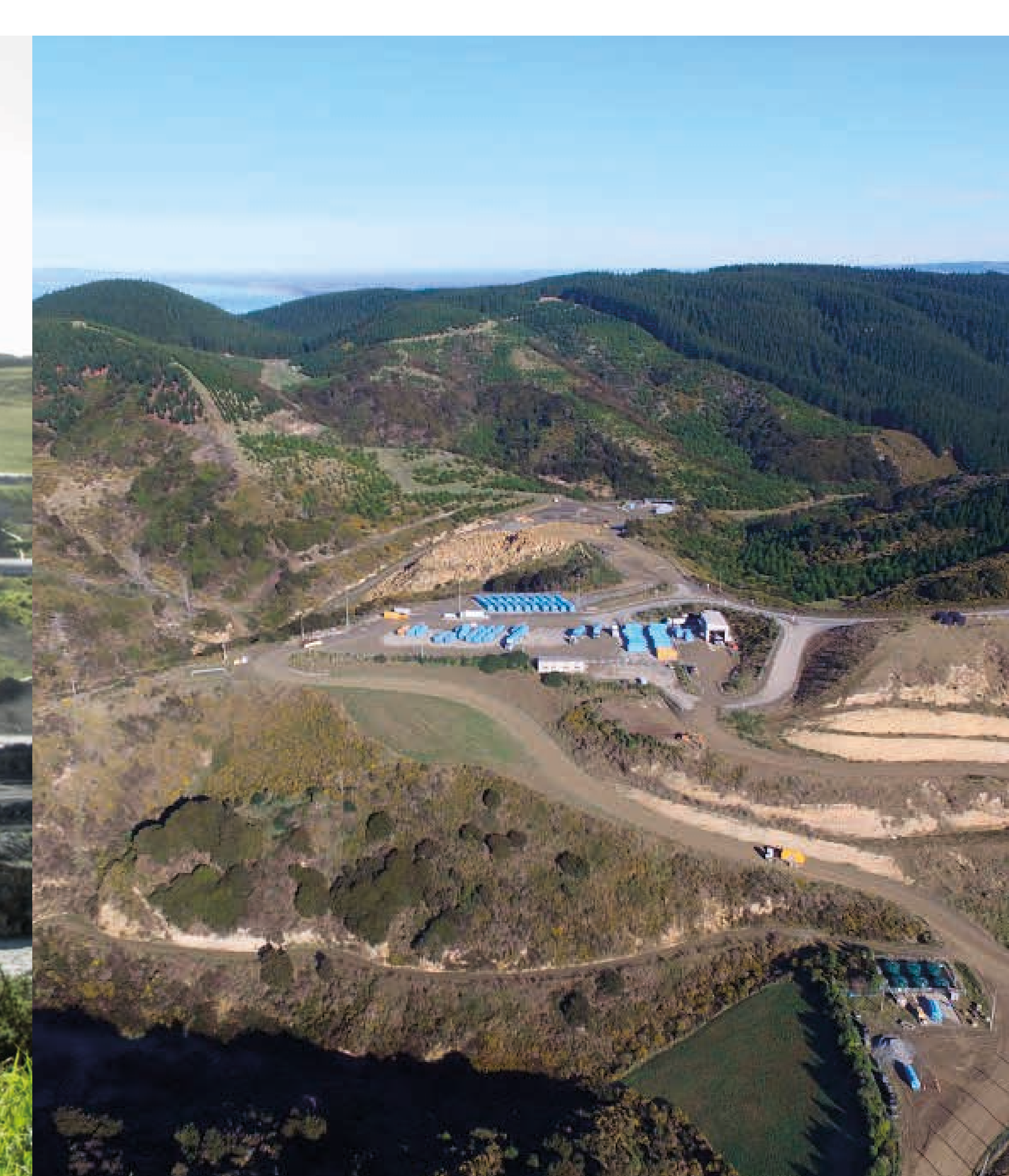
Kate Valley Landfill and Energy Park, Hurunui District, North Canterbury