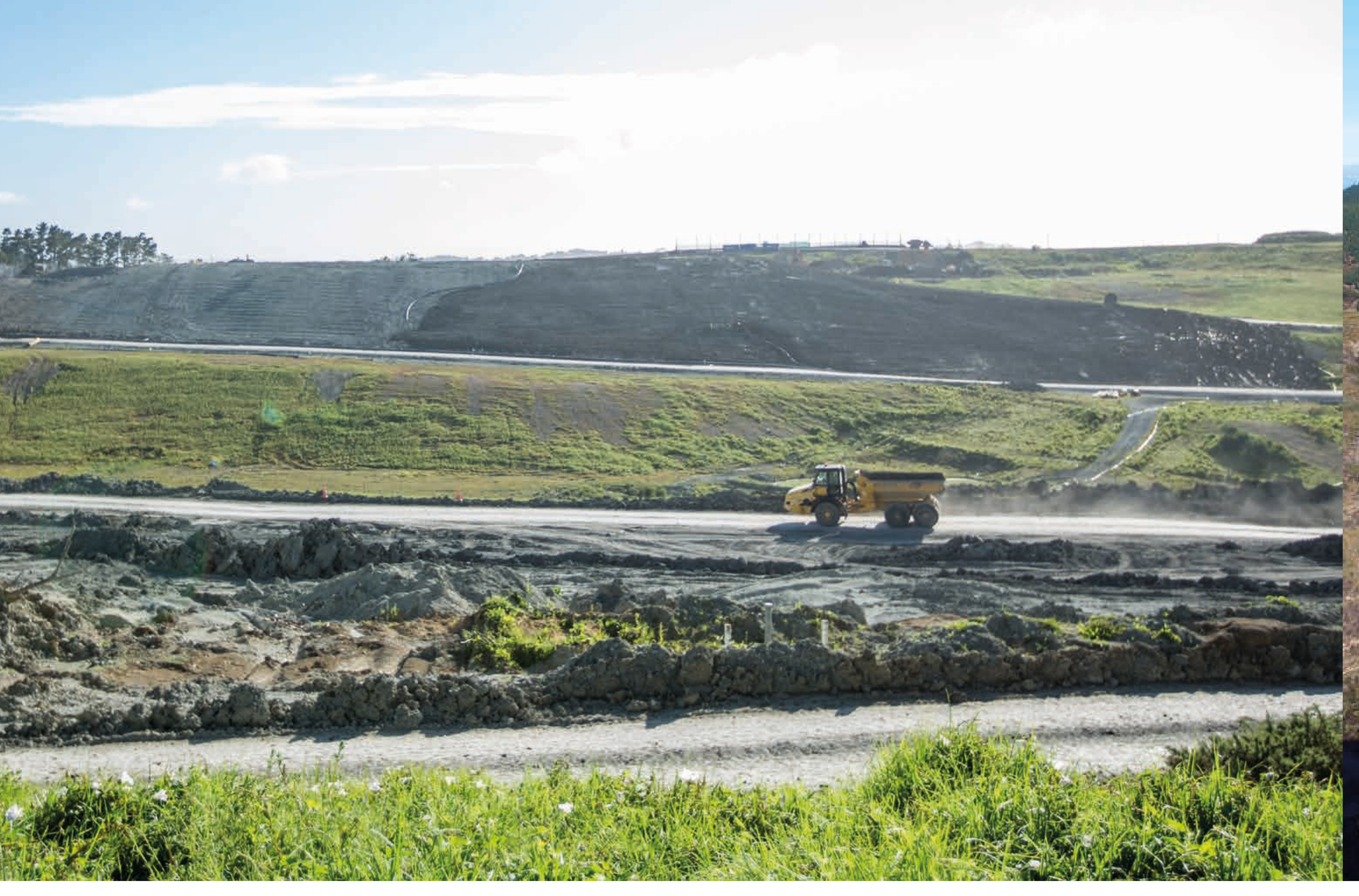
Redvale Landfill and Energy Park, Dairy Flat

<sup>2</sup>